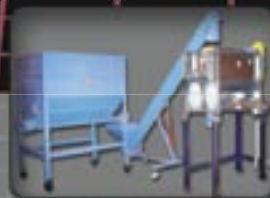
Rubber Mixing & Weighing System