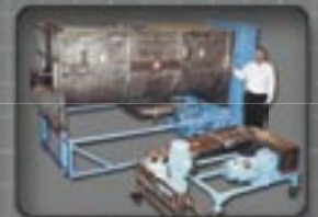
Pigments Dryer Feeding System

For more information contact one of our Sales Engineers sales@showes.com showes.com