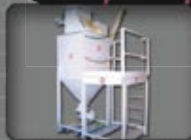
Unloading & Conveying System