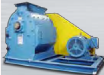
Rotary Knife Cutter

Our heavy duty machines can reduce the size of feedstocks for downstream processing.