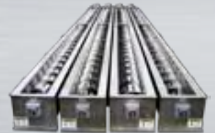
Stainless & exotic alloys

S. Howes conveyors are built to handle most non-liquid materials and are significantly more robust than typical CEMA conveyors.