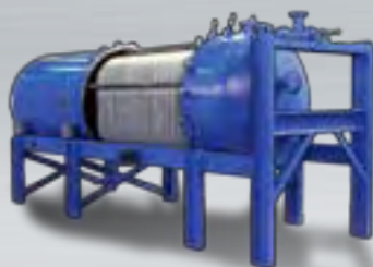
Horizontal Leaf Filters