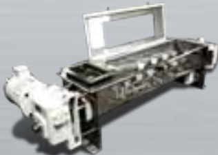
Continuous Lab Mixer