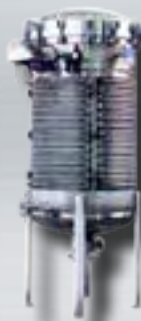
Vertical Leaf Filters