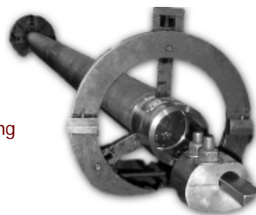
u-trough screw shaft in machining process