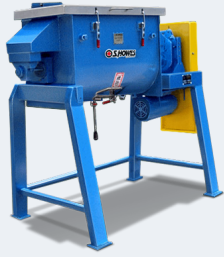
Jacketed Processing Mixer

S. Howes' mixers have robust and heavy-duty construction and are built with proven designs to deliver superior, uniform mixing and blending. Batch, continuous, ribbon, paddle and custom agitator mixing designs are available for your oil and gas processing needs.