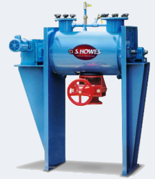
Vaccum & Drying