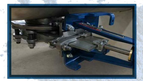
Optional Slide Gate

Belt driven mixers are proven reliable and easily serviced for less downtime on your mixing system.